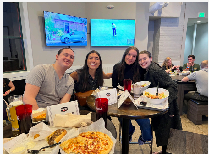
Students enjoying a night out at the Faculty/Student dinner April 11, 2024.