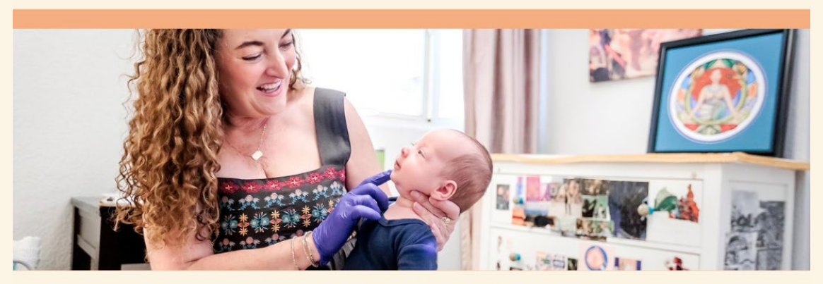
TRAINING DIVERSE LACTATION PROFESSIONALS TO MEET COMMUNITY NEEDS!

The Lactation Consultant Training Certificate Program allows students to meet the eligibility requirements to complete the International Board-Certified Lactation Consultant (IBCLC) Exam and, once students pass the exam, work as a credentialed IBCLC. IBCLC.