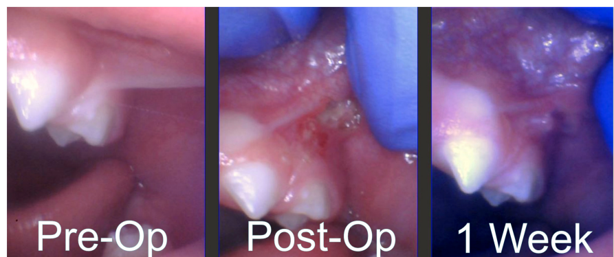
FIGURE 4 CO 2 laser release of restricted buccal frenum in a child. In this photo, the left buccal-tie of a 2-year-old male was released with a CO 2 laser. The initial appearance of the restricted frenum, immediate post-op photo and 1-week healing photo are shown from left to right.