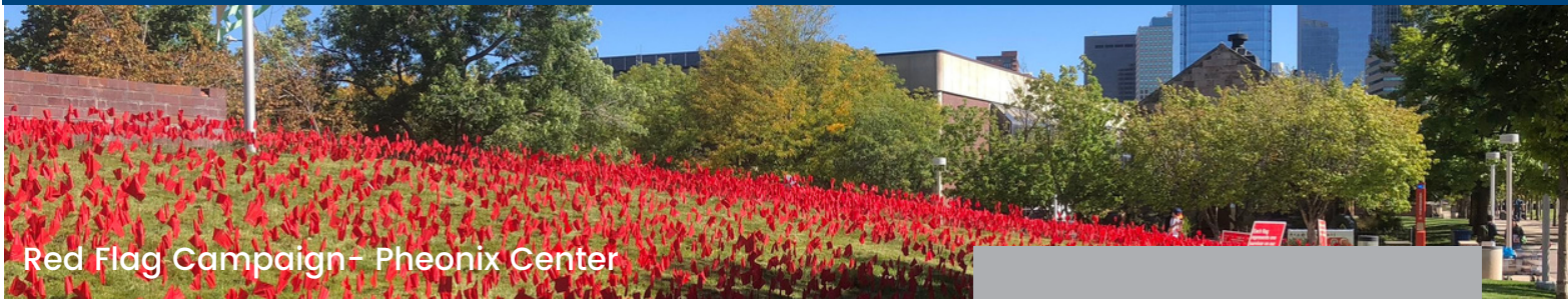
Red Flag Campaign – Phoenix Center