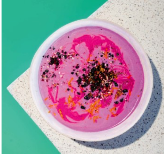
Creamy Batik Soup

Engage your inner culinary Abstract Expressionist! This bright, colorful soup is full of rich flavor and defies convention. Serve it either hot or chilled.