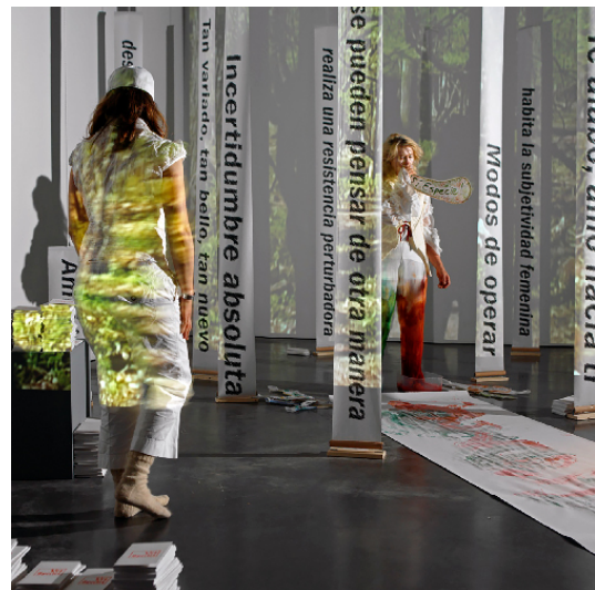
Images: Clockwise from top - Secret Love Collective, Shattered Moon Alliance, subRosa, Ladies