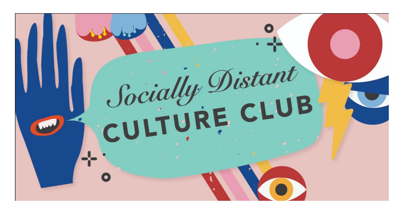
April 15, 2020

Hello, my delightful Arty Happy Hour Companions!