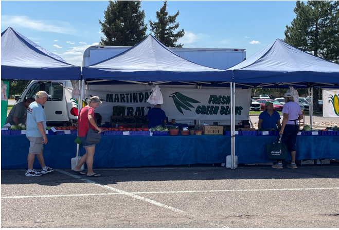
Littleton SW Plaza Farmers Market