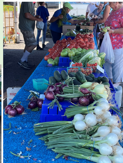
Littleton SW Plaza Farmers Market