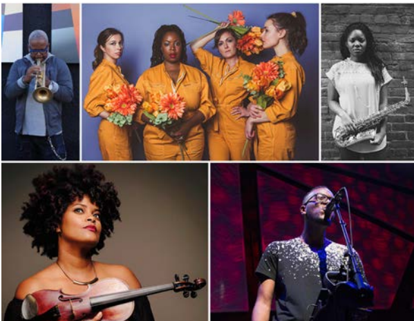
Virtual Jazz Celebration