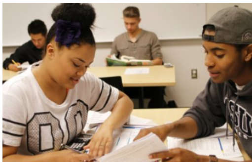
Much of the learning in peer study comes from students helping each other solve challenging math problems.

“I can give them assignments that would have alienated them the first two weeks of